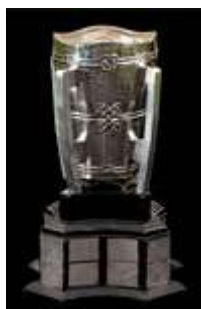
Liam McCarthy Cup