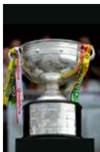
Sam Maguire Trophy

The race for the Sam Maguire looks between Donegal who are the current Champions, Dublin, Mayo, Kerry and Tyrone. Kildare have had so many chances, but for me, they have had their chances, and blown it, so I do not think they will make much of an impact in 2013. Dublin may be the biggest danger to Donegal holding onto the Sam Maguire, but for this pundit, it may be the year of Mayo